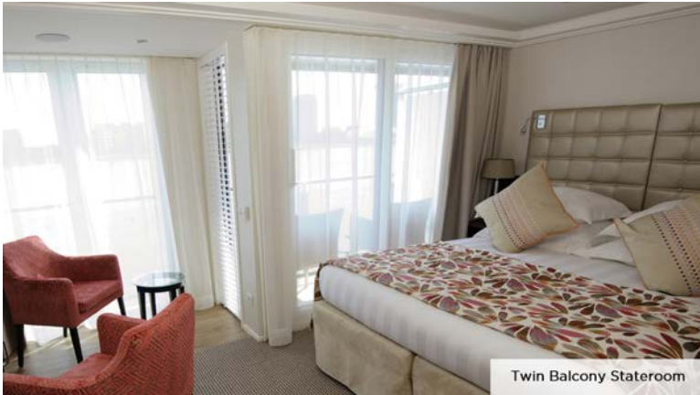
Twin Balcony Stateroom

7-night cruise | December 18-25, 2023 | Aboard AmaMora